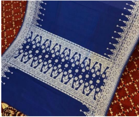
Figure 2.7 SongketTretes