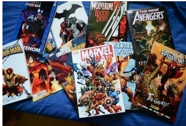
Figure 2.2 Comic Book

Comics are generally published in book form, with each volume along with a whole story. Comic books usually have complete stories and are published in series. Those who are presented with a sustainable story are also supplied with a story that is not sustainable.