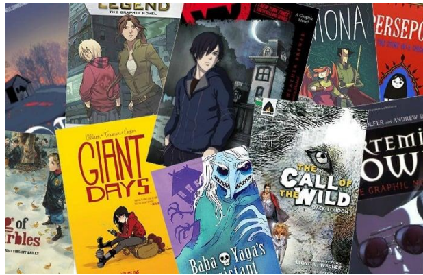
Picture 2.3 Graphic Novel