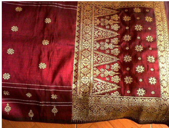
Figure 2.8 Songket Bungo Pacik

Songket bungo pacik is woven with white cotton thread, gold thread is barely visible on the surface of the cloth and fills some of the intermittent motifs. The Bungo songket cloth is mainly worn by Palembang residents of Arab descent.