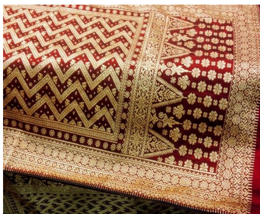
Figure 2.5 Songket Lepas

Lepas is a type of songket with gold thread patterns that cover almost the entire songket cloth. The beauty of this type of songket motif is seen in the even distribution of gold threads, which almost completely cover the fabric's surface. This is in accordance with the meaning of lepus, which means to cover.