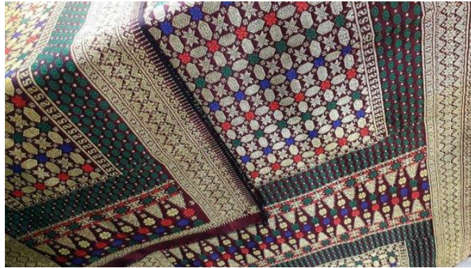
Figure 2.9 Songket Combination

This songket motif is a combination of different separate songket types. For example Bungo Cina is a combination of Tawur and Bungo Pacik, whereas Bungo Intan is a combination of Tretes Mender and Bungo Pacik.