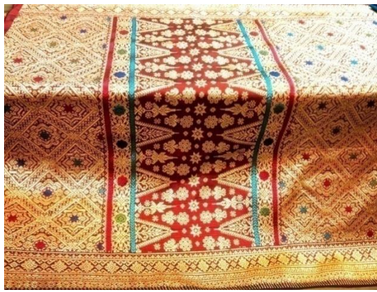
Figure 2.6 Songket Tawur

Songket tawur is famous for its characteristic which has a spreading motive, in accordance with the meaning of the word tawur, which is scattered or spread. Tawur songket differs from other types of songket in that the motifs on the surface of the cloth on tawur songket are seen in groups and spread out. Unlike songket fabrics in general, the weft threads that form the motif are not inserted at the fabric's edges.