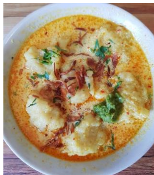
Figure 2.6 Celimpungan

Celimpungan is a typical Palembang food made from fish that has been processed with flour. This Celimpungan has similarities with tekwan in terms of shape, which is slightly round. Celimpungan is usually eaten during Eid al-Fitr.