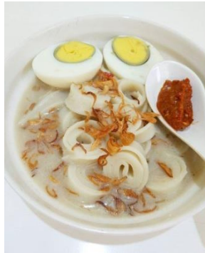
Figure 2.7 Burgo

Burgo is a typical Palembang food made from rice flour and tapioca flour then cooked in a roll. Burgo is usually served with a sauce made of coconut milk mixed with turmeric, garlic, galangal and kencur. Burgo is more delicious to eat if we add chili and lime.