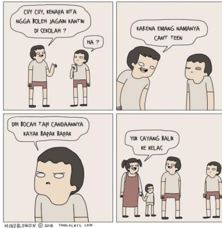
Figure 2.1 Comic Strip

A comic strip is a short comic that consists of several panels, and usually contains humor in the story. There are two other derivative forms of this type of comic, namely continuous strips and comic cartoons. Continuous strip comics have serial stories and are usually featured in newspapers and magazines. The comic strip often shows a picture from the public or community about the occurrence or activity of protests and is wrapped in funny jokes but still critical.