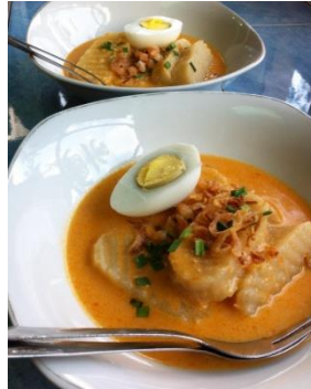
Figure 2.5 Laksan

Laksan is a typical Palembang food made from processed fish. Laksan is usually served with a sauce made using coconut milk and topped with chili so that it has an orange color. This food is usually eaten in the morning.