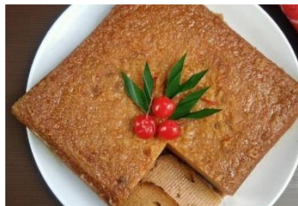
Figure 2.8 Kue 8 jam

Kue 8 jam is a cake that is a typical food of the city of Palembang. This cake has something special because this cake is cooked for 8 hours. This long cooking time makes the food delicious and soft. Usually this cake is eaten during Eid al-Fitr so it is quite difficult to find on ordinary days.