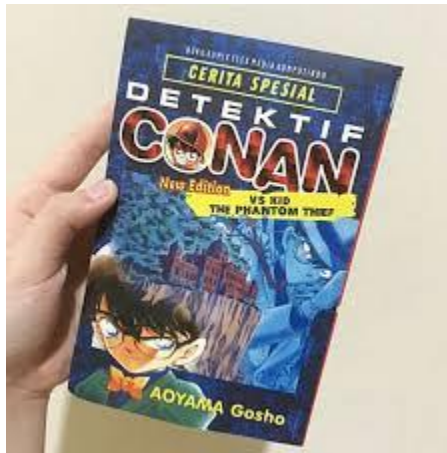
Figure 2.2 Comic Book

included in the type of fiction book. Comic book is created in several volumes which consist of parts of the story topic called chapter. The contents of this book are fictional stories that are not based on real life.