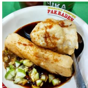
Figure 2.4 Pempek

Pempek is a typical Palembang city which is very famous in Indonesia. Every tourist who wants to visit the city of Palembang will definitely taste Pempek. Pempek is made from fish that has been processed and then modified with tofu and eggs. Pempek must be eaten with a sauce called cuko to make it more delicious. Cuko is made with chili, garlic.