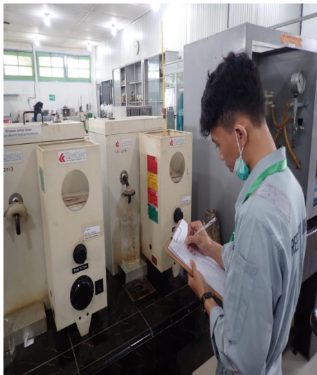
L.3.9 Analisa Destilasi