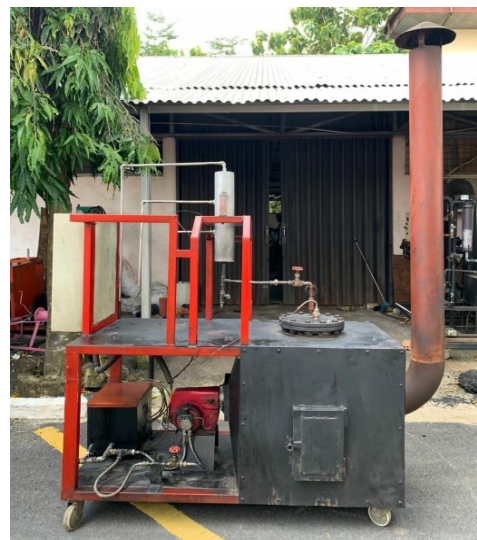
L.3.12 Alat Pirolisis