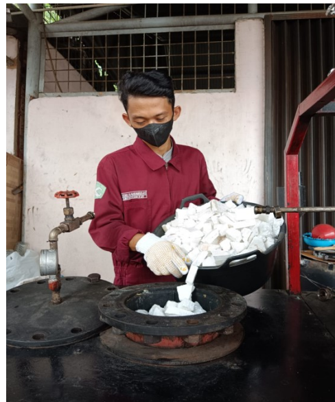
L.3.4 Preparasi Pra-running