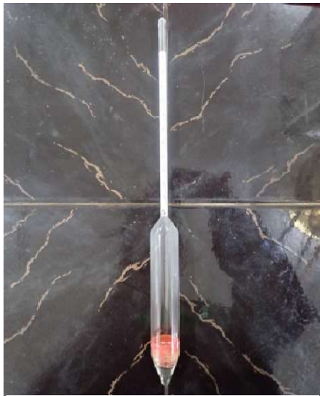
L.3.7 Analisa Densitas