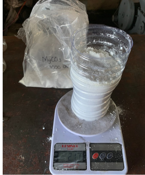
L.3.2 Preparasi Katalis