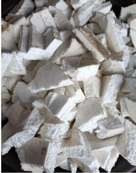
L.3.1 Preparasi Bahan Baku