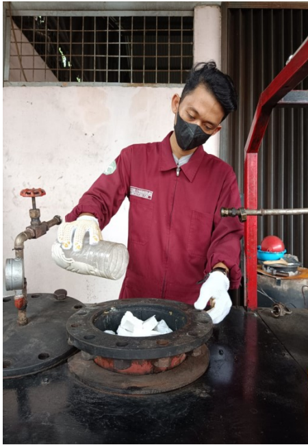
L.3.5 Preparasi Pra-running