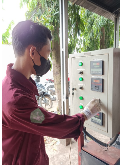
L.3.6 Pengaturan Set Point