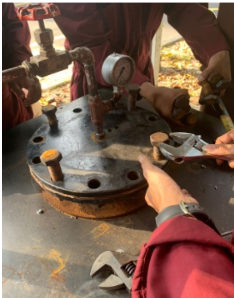
L.3.3 Preparasi Pra-running