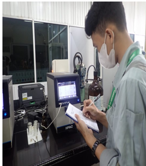
L.3.10 Analisa Octane Number