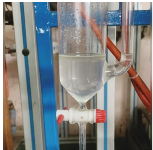
Hasil Minyak Lavender