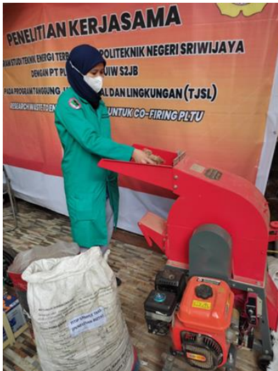
Fig. 3. EFB Size Reduction

Figure 3 shows the equipment used to reduce the size of the EFB to 60 mesh.