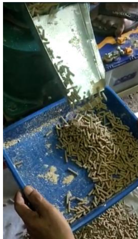
Fig. 5. Biopellet from pelletizer

Fig. 4 shows the equipment used to produce biopellets, whereas Figure 5 shows the finished products.