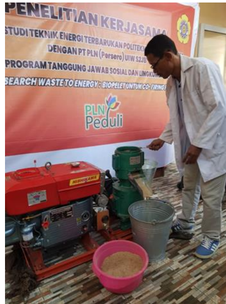
Fig. 4. Pelletizer

Empty palm fruit bunches of 60-100 mesh are blended in a 60:40 ratio with glue (50% starch). A pelletizer with a diameter of 6 mm is used for biopellet printing. The resulting biopellets are analyzed to obtain their characteristics according to the Indonesian national standard SNI 8951: 2020, includes proximate and ultimate analysis and heating value of biopellets.