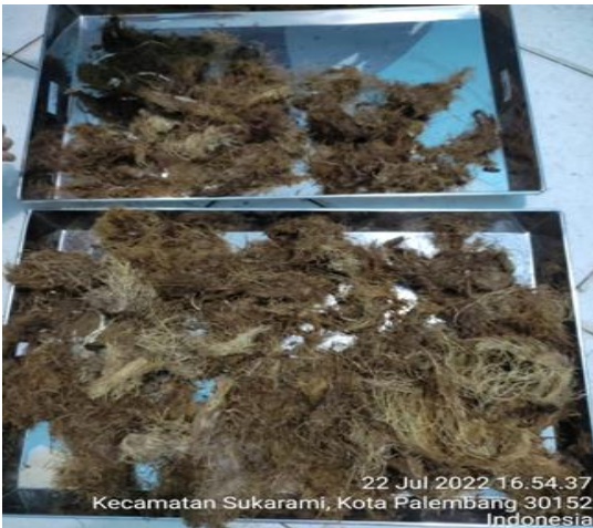
Fig. 2. Empty fruit bunch

Figure 3 shows the equipment used to reduce the size of the EFB to 60 mesh.