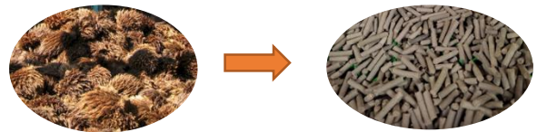
Fig. 7. Biopellets from EFB

Pellets produced following analysis and selection based on the characteristics of the feedstock material pellet product. The heating value of the feedstock materials was tested using a bomb calorimeter in the first selection procedure. The objective was to get high calorific value and physically strong feedstock material for pellet production. The optimum calorific value will be chosen to be processed into pellets. The results of biopellet from EFB using a pelletizer can be seen in Figure 7.