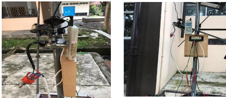
Figure 1. Solar power plant prototype.

The research carried out the design of a prototype circuit system for solar tracker, so that it was expected that it would be able to reduce the power load generated to drive the solar tracker motor and solar panels that would produce maximum power. The design of the equipment used is, Mixenoch Monocrystalline Solar Module 50wp, solar panel, drive motor, Charge Controller, Inverter, Accumulator, and Solar Tracker Shown in figure 1.