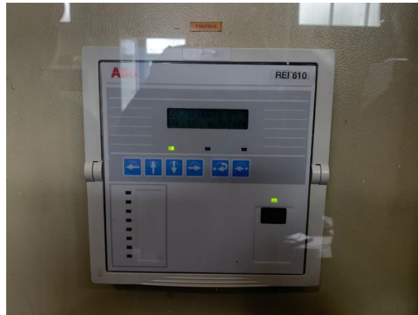
Gambar 4. Relay REF 610 PLTG Borang