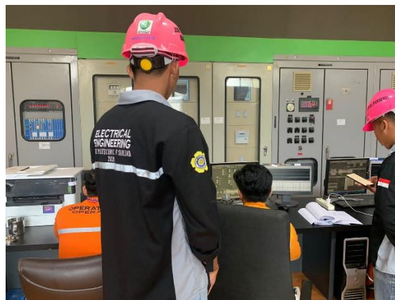
Gambar 5. Ruang Operator PLTG Borang