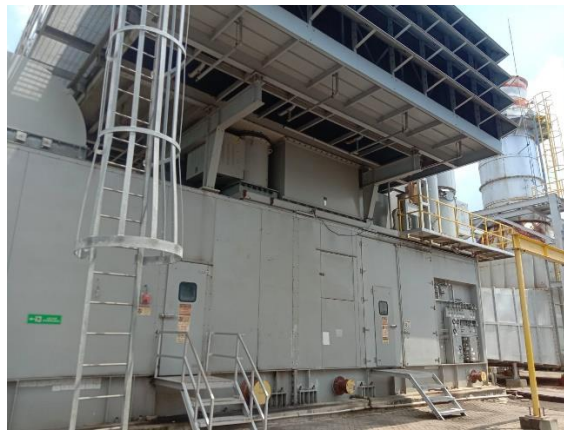
Gambar 2. Generator 2 PLTG Borang