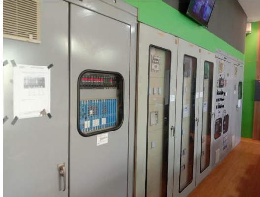
Gambar 1. Proteksi Generator PLTG Borang