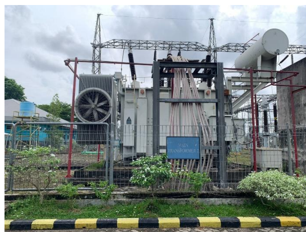
Gambar 6. Trnsformator Unit 2 80 MVA PLTG Borang