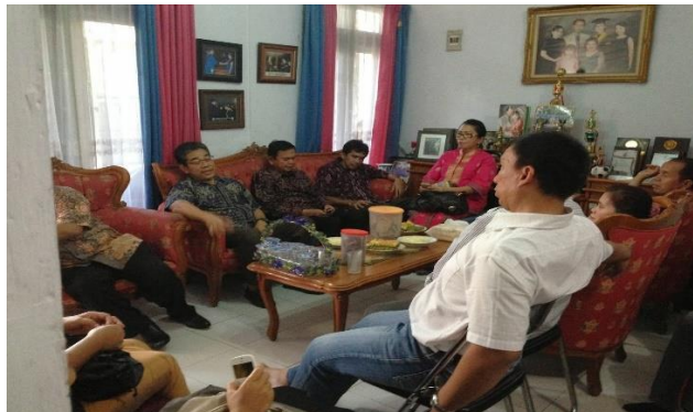
Picture of Marhata Sinamot