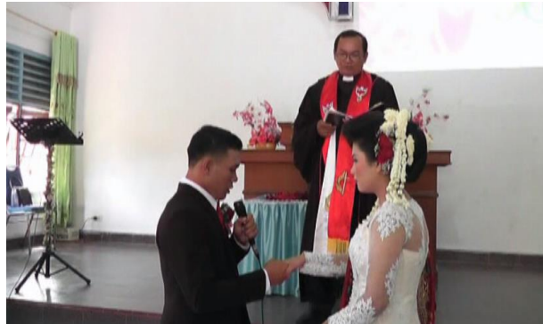
Picture of Pesta Unjuk