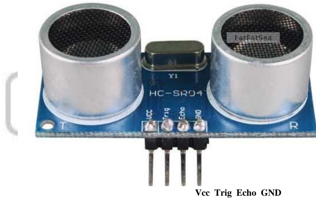
Vcc Trig Echo GND