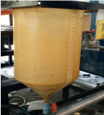
Gambar 55. Flowmeter