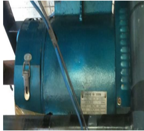
Gambar 50. Generator