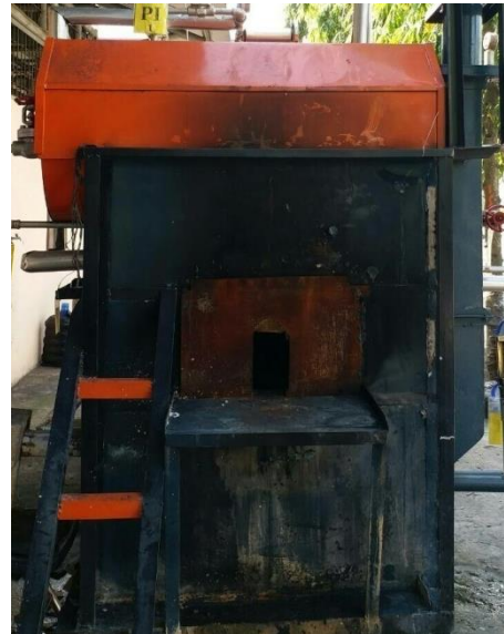
Gambar 42. Furnace