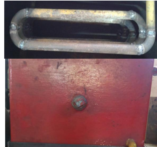
Gambar 46. Kondensor