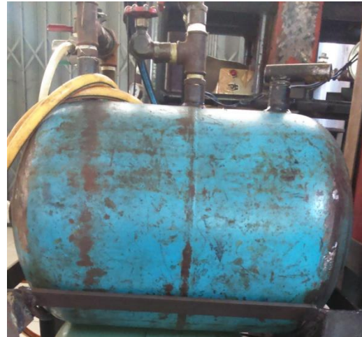
Gambar 44. Tangki Bahan Bakar