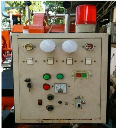
Gambar 49. kontrol Panel