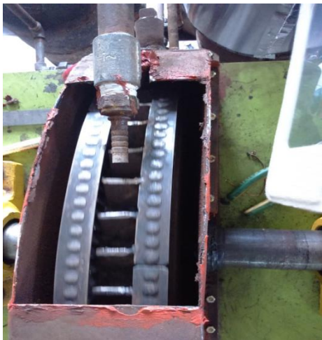
Gambar 45. Sudu Turbin