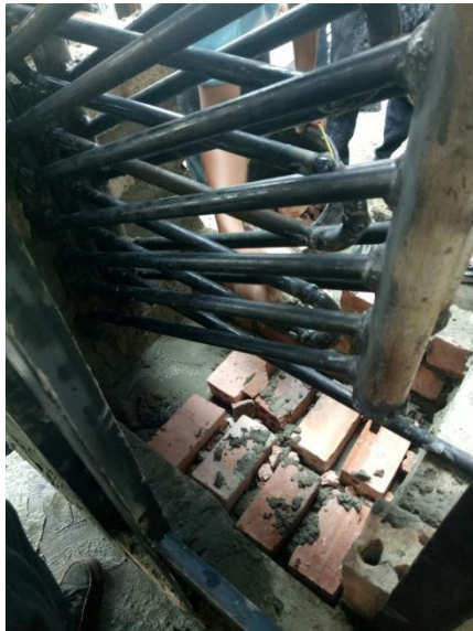
Gambar 41. Tubesheet Superheater