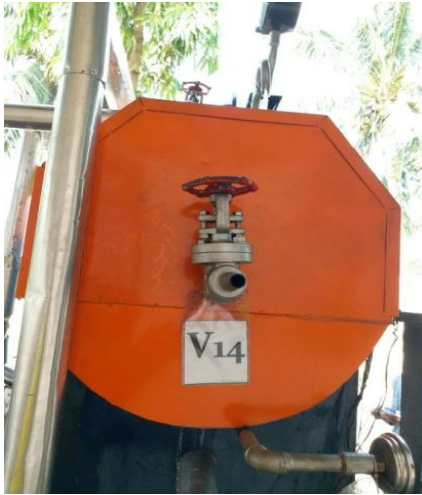
Gambar 39. Steam Drum