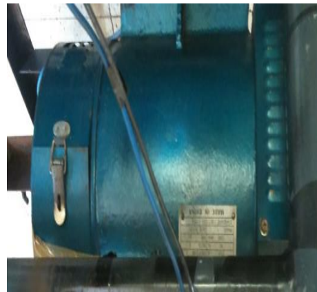
Gambar 41. Generator