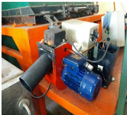
Gambar 42. Burner