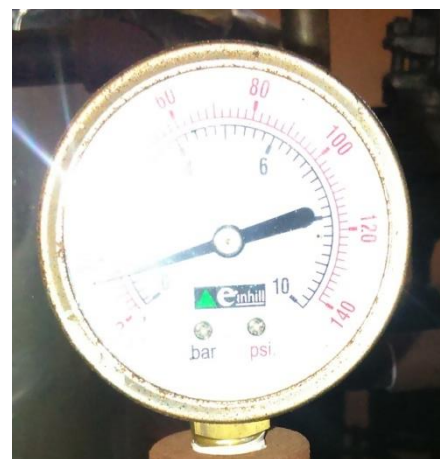
Gambar 45. Pressure Gauge