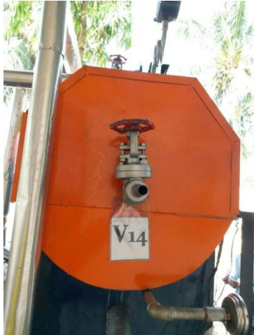
Gambar 30. Steam Drum