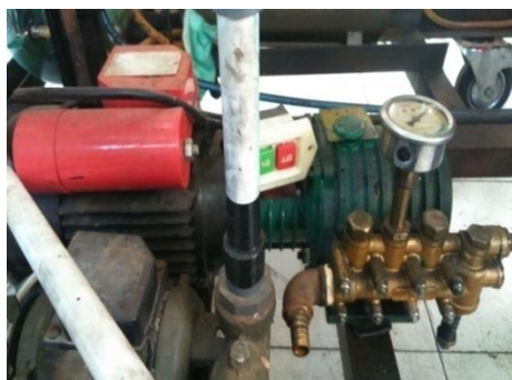
Gambar 38. Pompa