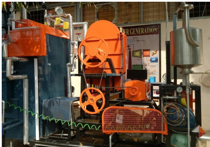
Gambar 49. Prototipe Steam Power Generator Keseluruhan