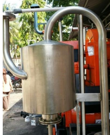
Gambar 47. Water Tank