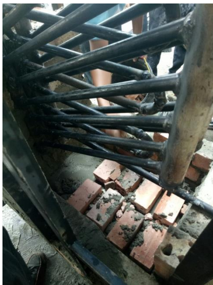
Gambar 32. Tubesheet Superheater