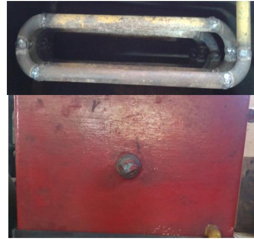
Gambar 37. Kondensor