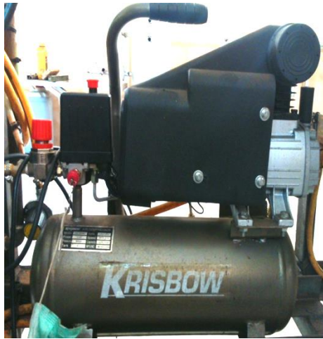
Gambar 19. Kompresor