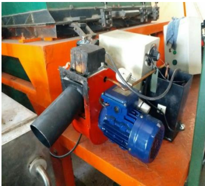
Gambar 27. Burner