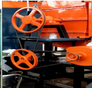
Gambar 28. Open Pulley Sistem