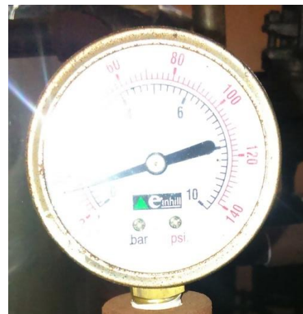
Gambar 30. PressureGauge