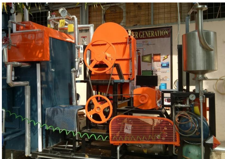
Gambar 34. Prototipe Steam Power Generator Keseluruhan