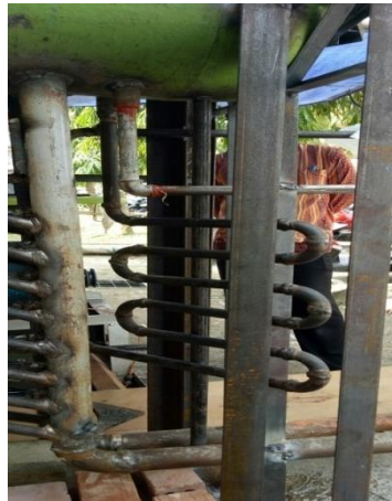
Gambar 33. Tubesheet Economizer