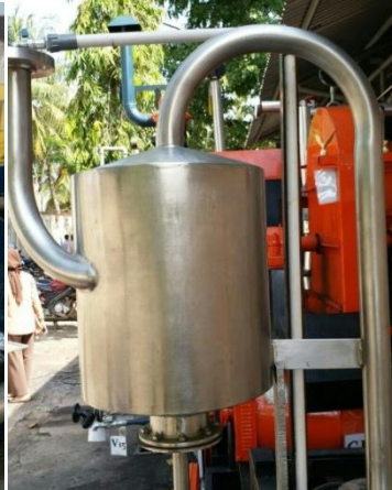
Gambar 32. Water Tank