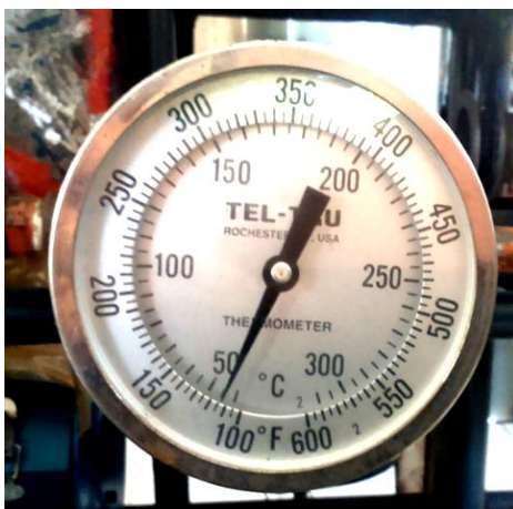
Gambar 29. Temperature Gauge