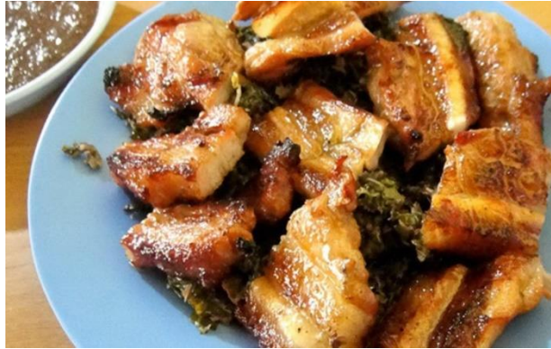
Figure 2.5 Babi Panggang Karo (BPK)