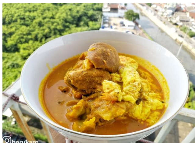
Figure 2.8 Arsik Babi