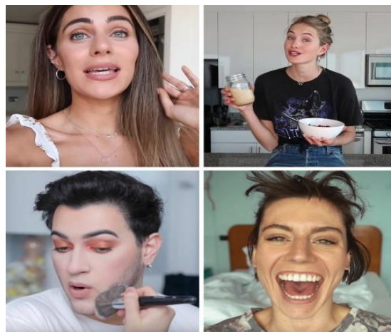
Figure 2.4 Entertainment