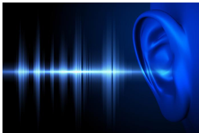
Figure 2.1 Sounds