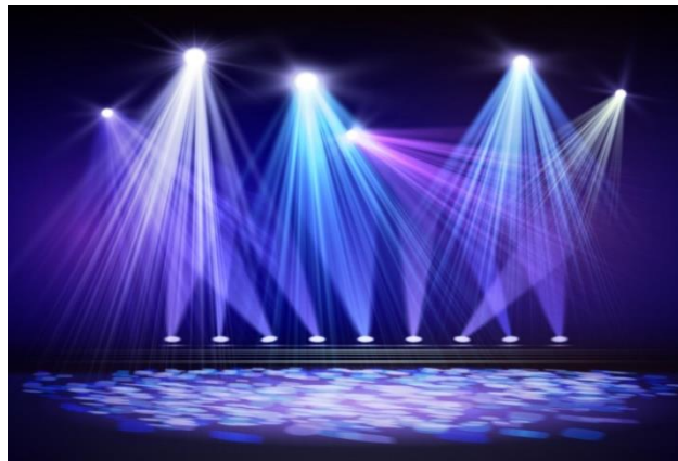
Figure 2.2 Lighting