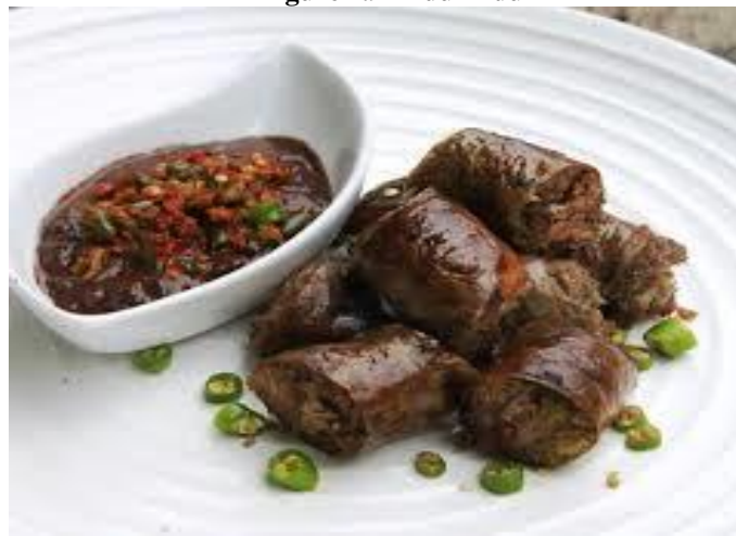
Figure 2.9 Kidu Kidu

(sources: https://resepnusantara.id/resep-membuat-kidu-kidu-batak/ )